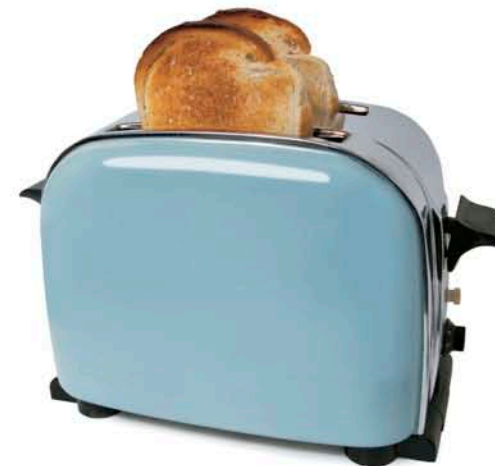
Give back to the toaster that toasts your toast!

(30.5 x 25.5 x 15.2 cm) toaster. Customize your cozy with graphic motifs reminiscent of your childhood sticker album.