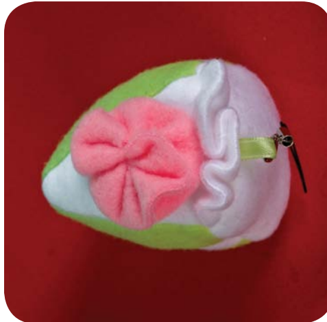
This top view shows the rosette and ruffle details.